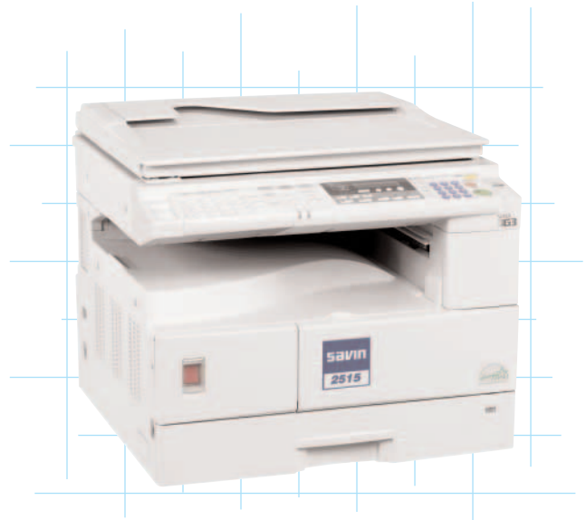
The 2515 with Platen Cover.

Easily manage print jobs with SmartNetMonitor. Comprehensive software provides real-time information – system configuration, system status and paper supplies – to users and network administrators, which enables users to manage their own tasks while reducing network administrator intervention.