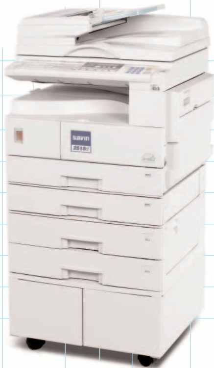
The 2518d with Automatic Duplex Unit, 50-Sheet ARDF, PS450 Paper Bank and Console.